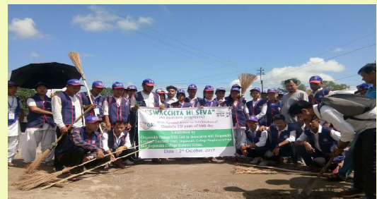
'Swacchta Ki Sewa' Aviyon