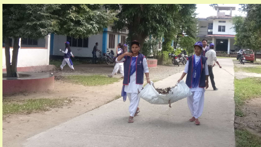
Clean Drive Programme at College Campus by NSS Volunteers