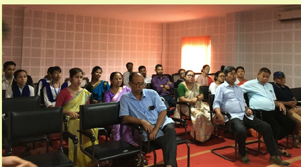
DIGITAL CONFERENCE ROOM