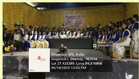
A Farewell Session