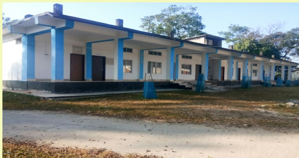
This building is well equipped assigned for Office of the KKHSOU, DODL and two Digital Class Room.