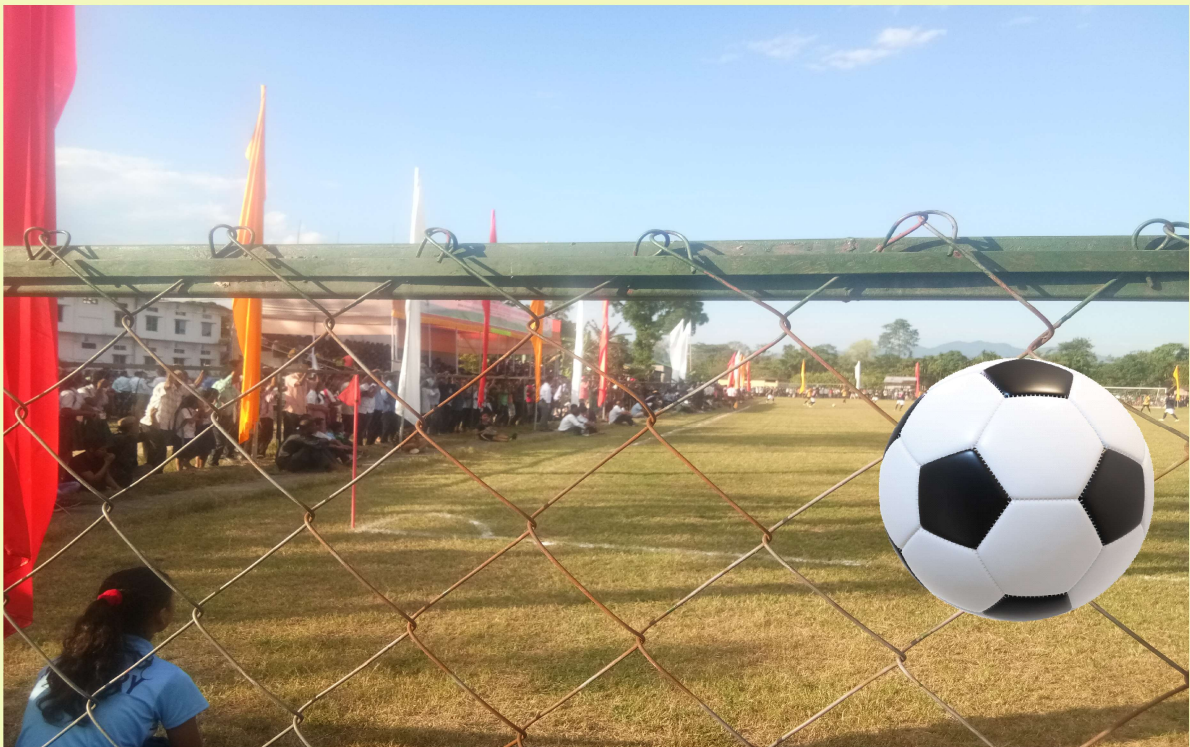
FOOT BALL PLAYGROUND