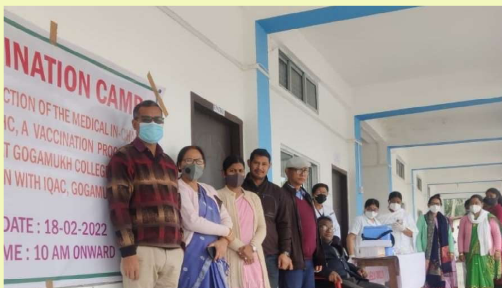
Covid-19 Vaccination Camp