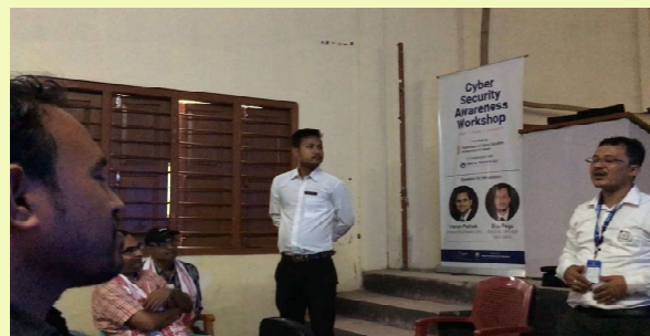
Awareness Programme on Cyber Crime in collaboration with Gratia Technology Pvt. Ltd, Guwahati.