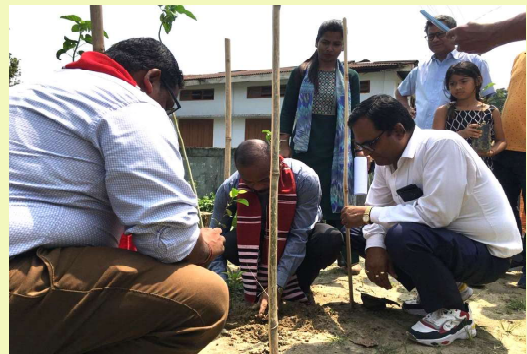
Plantation at Environment Day