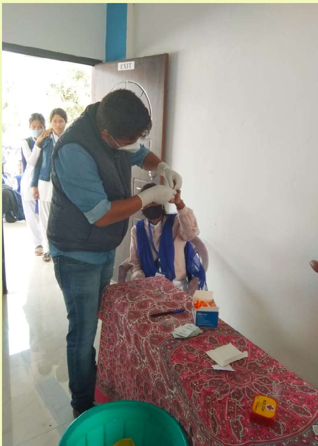
Blood Grouping Test Camp