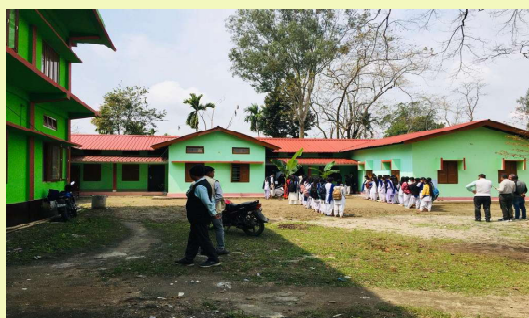
GIRLS' HOSTEL CAMPUS