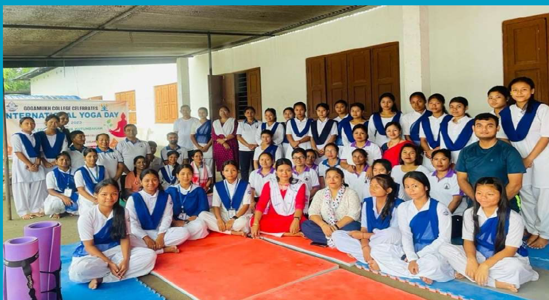
POST PHOTO SESSION ON CELEBRATION OF INTERNATIONAL YOGA DAY