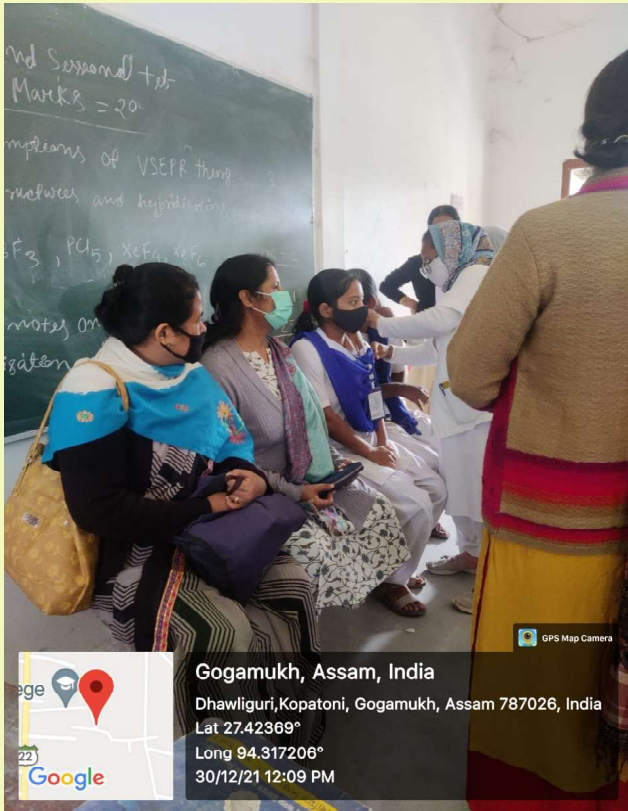
Encephalitis Vaccination Camp