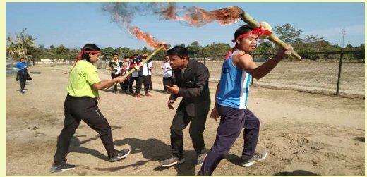
Olympic Flame carry over to open the Sports Week