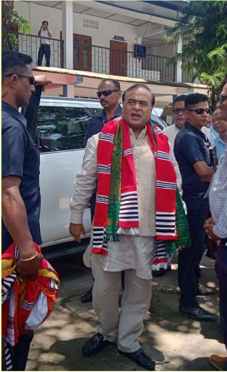
Dr. Himanta Biswa Sharma Hon'ble Chief Minister of Assam visited the College.